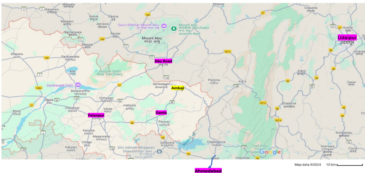
Toposheet No. 45D/15

Ambaji: N 2693000, N 2695500 E 280000, E 282500