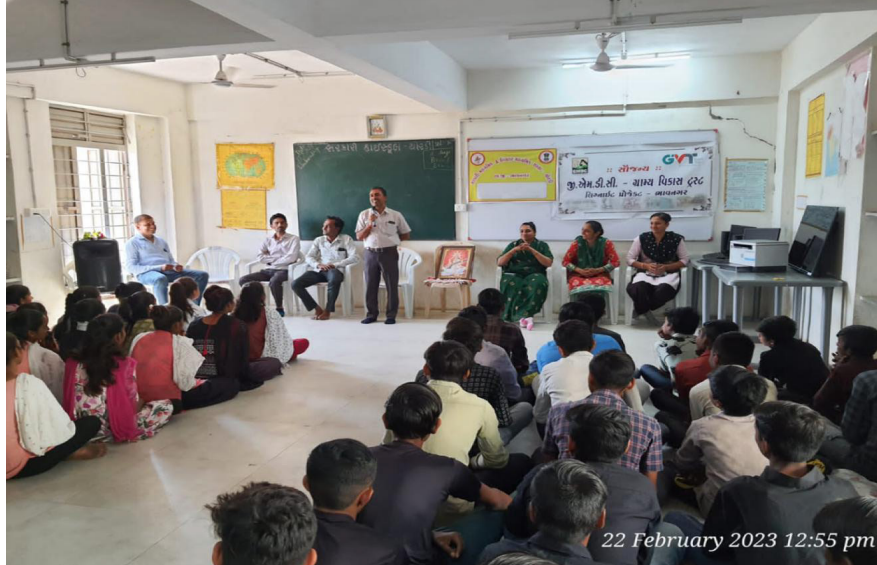
22 February 2023 12:55 pm

To enable computer education among school students and to strengthen IT infrastructure in Schools, GMDC under its CSR has provided Computer Sets, Printer & Smart LED TV to the Government Secondary & Higher Secondary School Thordi, near Lignite Project-Bhavnagar. The IT infrastructure set up has enabled the digital journey for the students.