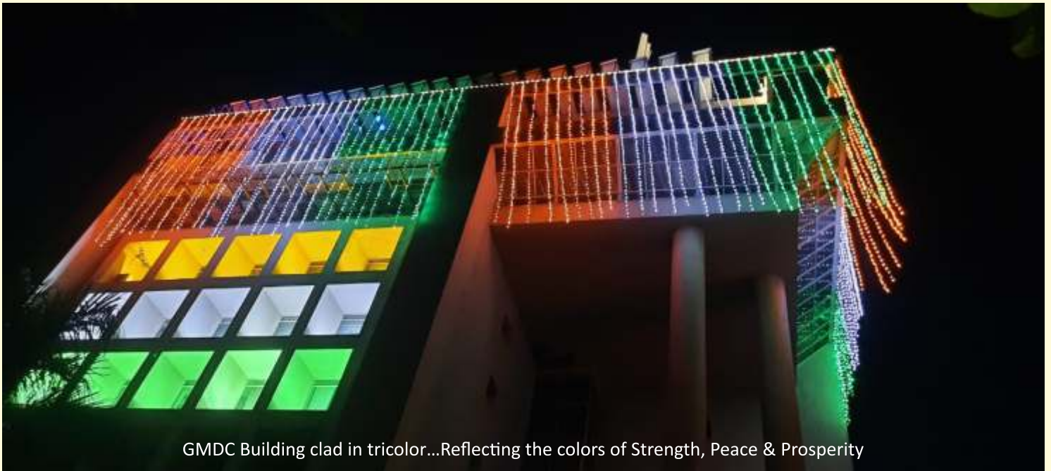
GMDC Building clad in tricolor...Reflecting the colors of Strength, Peace & Prosperity

As part of “Harghar Tiranga campaign”, GMDC corporate Office & all projects participated with pinning a virtual flag at their locations & by clicking a “Selfie with Tiranga” with full zeal & zest.